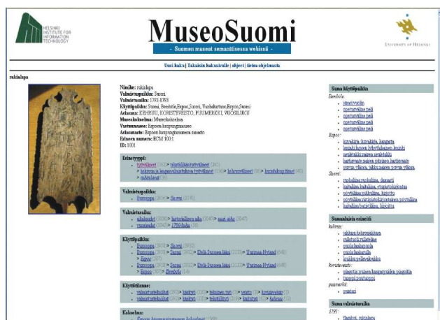
Figure 1: A collection object web page.